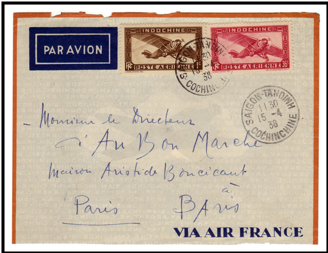
POSTAL MARKINGS SAIGON-TANDINH COCHINCHINE 15-4 38